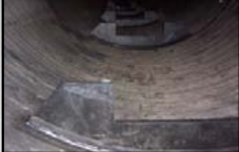
Custom-Built Fish Baffles